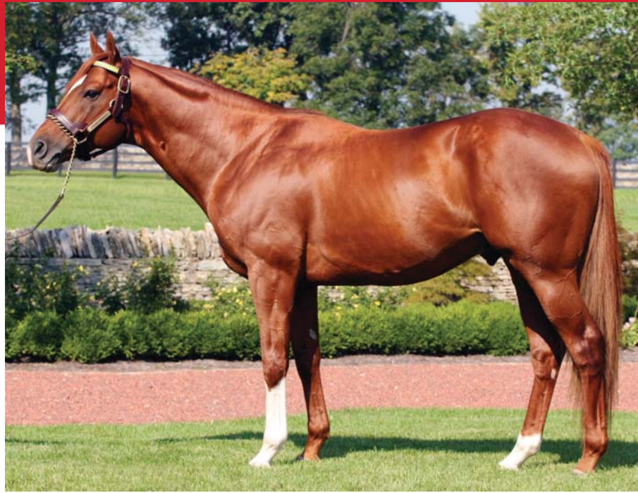
Leroidesanimaux, who stands for $7,500 at Stonewall Farm Ocala in Florida, raced exclusively on turf and sires winner of America's most prestigious race when Animal Kingdom wins Kentucky Derby in his dirt debut

FOR THE last 20 years or so, American breeders have been strongly averse to foreign-raced horses and American turf horses as breeding prospects. Perhaps the success of Animal Kingdom, neither of whose parents ever won on dirt, will help correct the somewhat irrational bias against grass runners that has warped the American breeding scene for the last two decades.