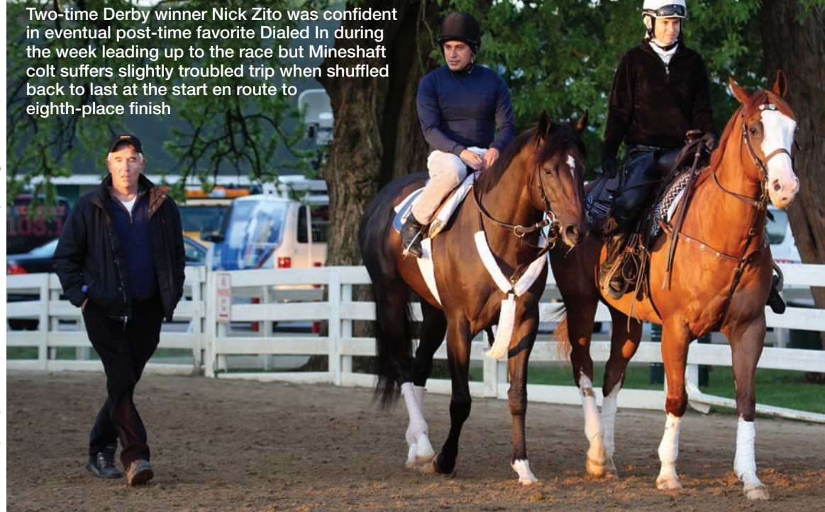
Two-time Derby winner Nick Zito was confident in eventual post-time favorite Dialed In during the week leading up to the race but Mineshaft colt suffers slightly troubled trip when shuffled back to last at the start en route to eighth-place finish