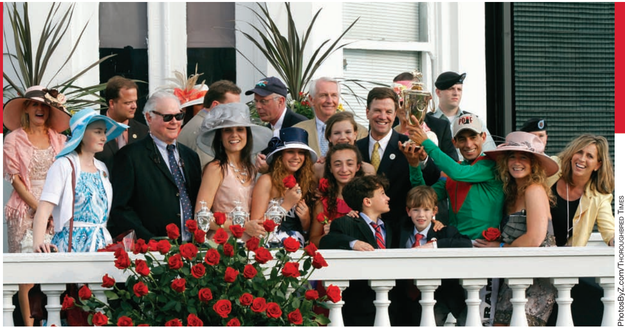
The victorious team and their families celebrate Animal Kingdom's victory

The big effort on Polytrack at Arlington led to a second maiden attempt on Polytrack at Keeneland on October 23, and Animal Kingdom responded with an au-