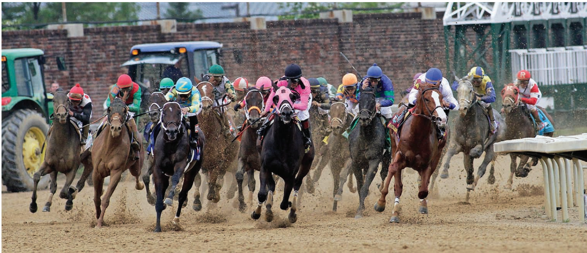
John Velazquez guides Animal Kingdom (second from left) well to the outside and takes aim at Nehro, Comma to the Top, and Shackelford with a quarter-mile to run