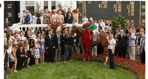
The 2011 Kentucky Derby winner's circle